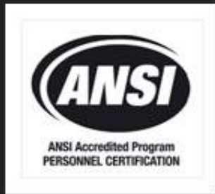
American National Standards Institute (ANSI)