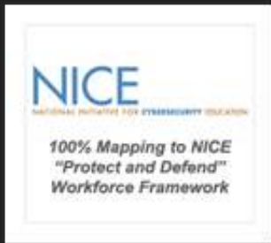
The National Initiative for Cybersecurity Education (NICE)