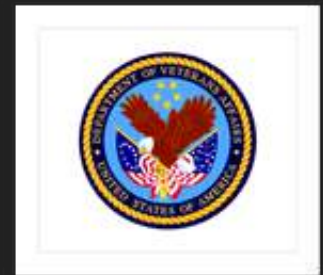
Department of Veterans Affairs